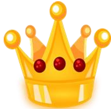
April "Princess of the Green" → Lorraine Crosswell