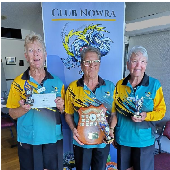
Teams from Illawarra and Sydney